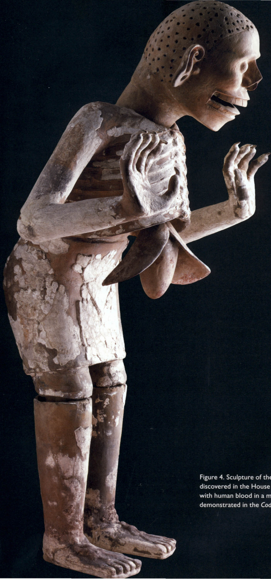
Figure 4. Sculpture of the God of Death discovered in the House of Eagles. It was bathed with human blood in a manner similar to that demonstrated in the Codex Magliabechiano .