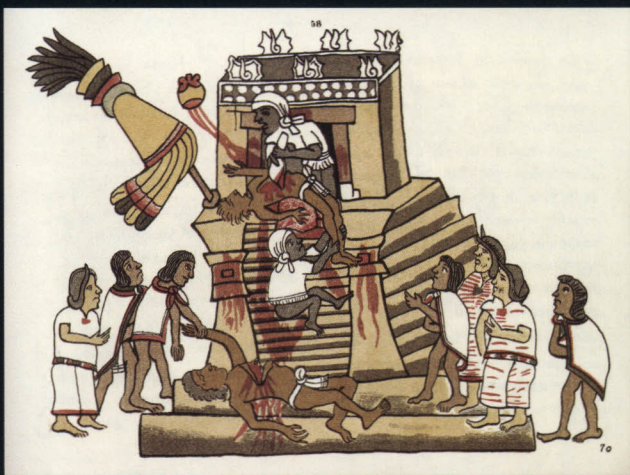
Figure 11. Sacrifice by extraction of the heart.