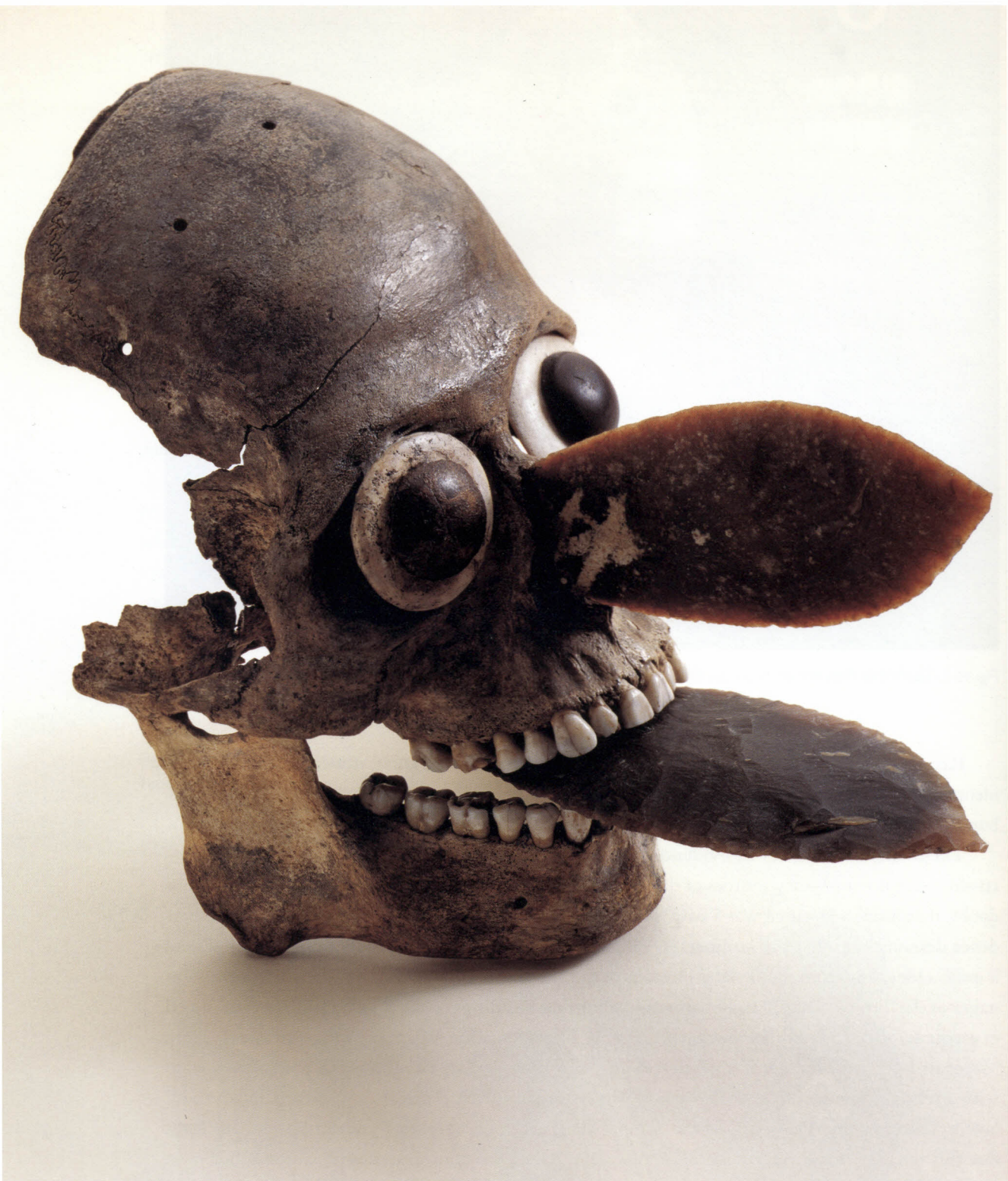
Figure 3. Skull-mask representing the God of Death, found at an offering of the Templo Mayor, Tenochtitlan.