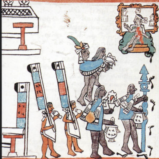
Figure 8. Sacrifice of a child personifying one of the little gods who assist the god of rain.