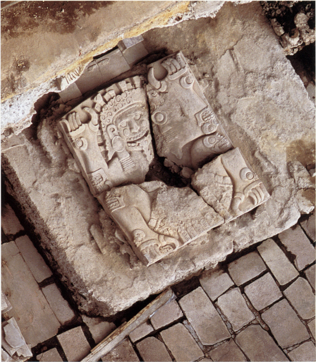
Figure 17. Monolith of the goddess of earth Tlaltecuhтли found in 2006 at the foot of the Templo Mayor. This divinity was fed human blood.

It is clear that the social phenomena of the remote past, including sacrifice and cannibalism, must be viewed as existing beyond the simple dichotomy of good and evil. They must be critically evaluated using the largest quantity of evidence possible. This is the only way in which we will understand that the Aztecs—with their virtues and faults, with their great contributions and their exaggerated ritual violence—were as human as any other ancient people.