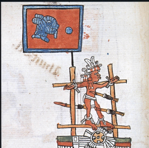
Figure 13. Sacrifice with arrows.