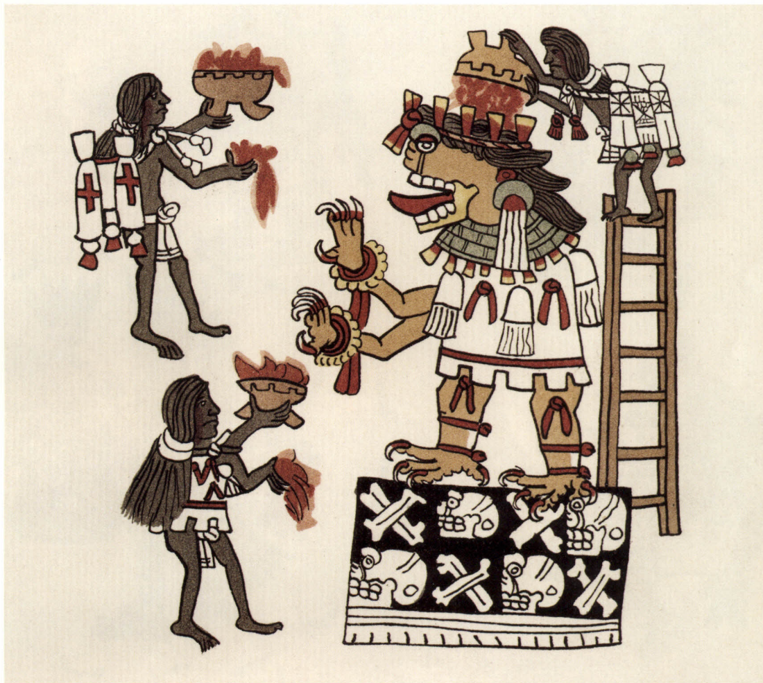
Figure 5. Image of the God of Death being bathed in human blood from the Codex Magliabechiano .