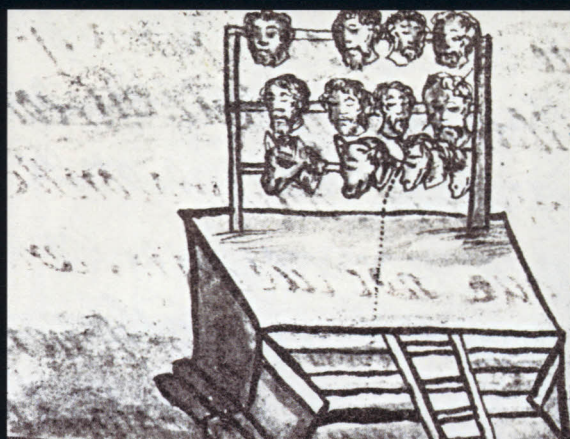
Figure 16. Heads of Spanish soldiers and horses exhibited as trophies at the tzompantli (skull rack).