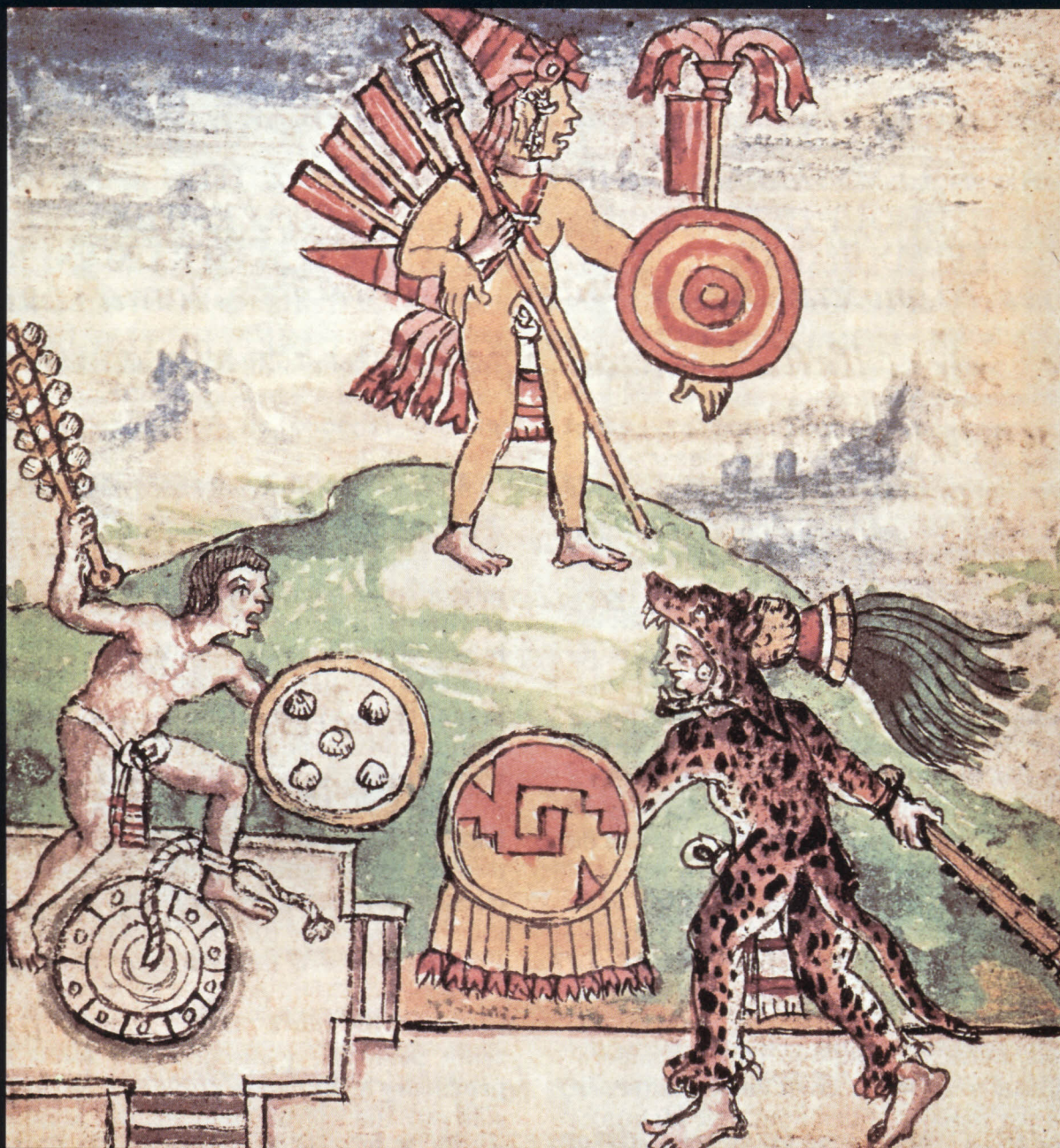
Figure 14. "Scratching" ceremony or gladiator sacrifice.