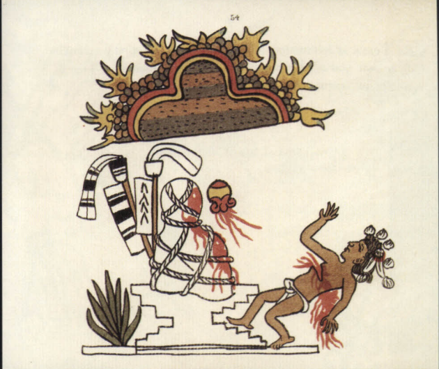
Figure 9. Sacrifice of a slave during the funeral of a master.