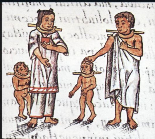
Figure 10. Wooden-collar slaves.