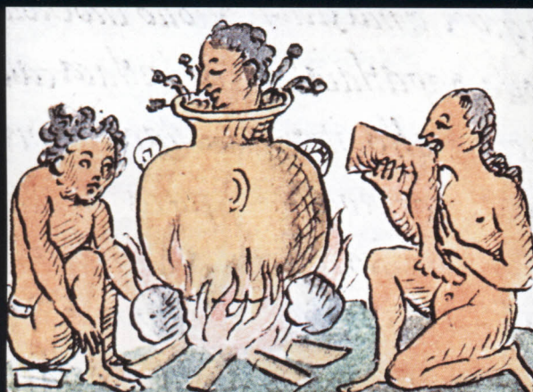
Figure 15. Ritual cannibalism.