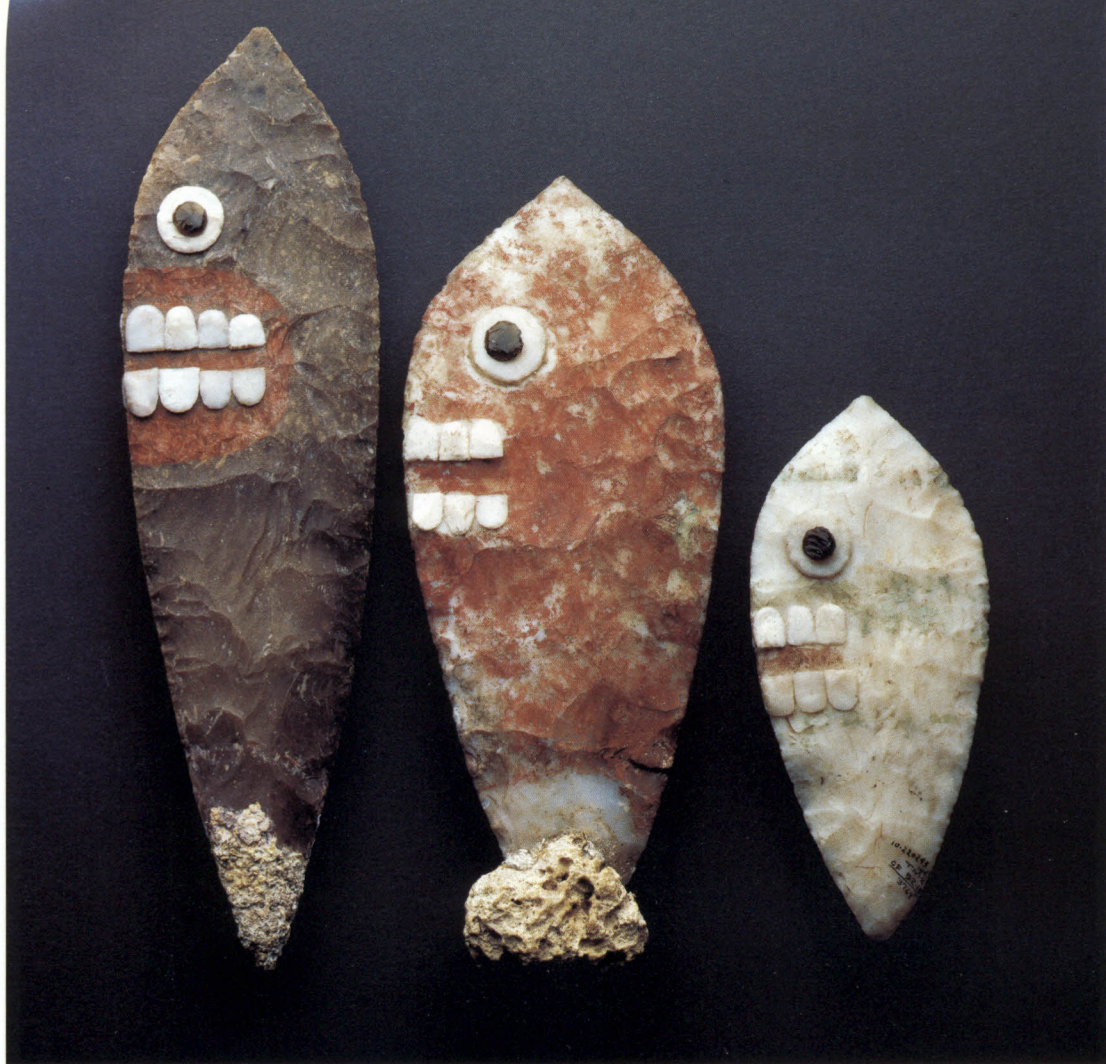
Figure 2. Sacrificial flint knives from an offering at the Templo Mayor, Tenochtitlan.

Recently, traces of blood on the surfaces of divine images, altars, and stucco floors have been identified (Figures 4 and 5). Thanks to modern techniques, significant concentrations of iron, albumin (the main protein in blood), and human hemoglobin were detected (López Luján 2006).