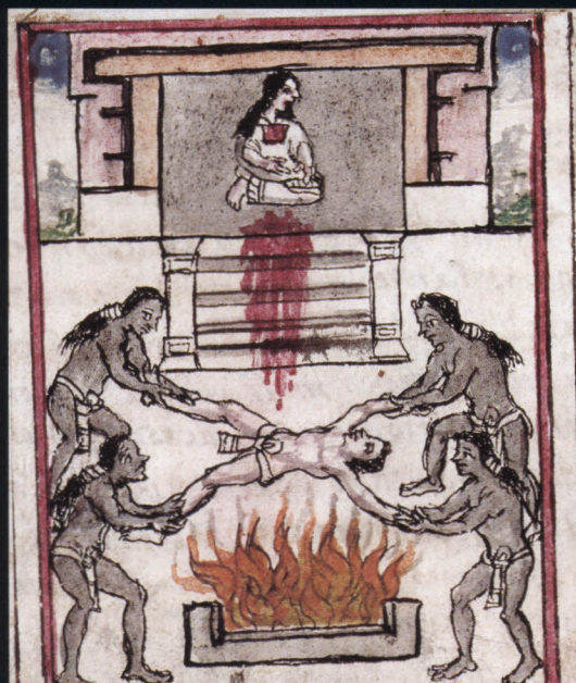
Figure 12. Subjecting a sacrificial victim to fire.