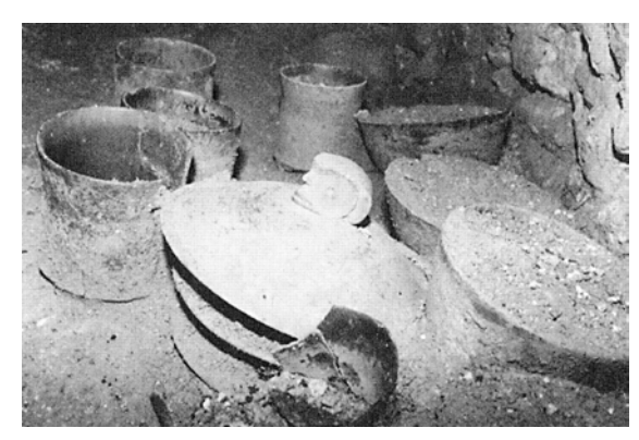
Fig. 4 Detail of in situ Early Classic vessels (monkey-head lid on basal-flanged bowl, cylinder tripods, and bowls) in the Caracol Structure D16 tomb from the South Acropolis.

which also has a small 9.19.0.0.0 monument showing two bound prisoners and which names a person in its main text who is associated with the Caracol emblem but who is not the ruler (Chase, Grube, and Chase 1991). Other nonrulers are also named in the late Caracol texts. This is suggestive of a phenomenon, also noted for Copan (Fash 1991), in which more individuals have access to previously restricted items such as carved stone monuments and titles towards the end of the Classic era.