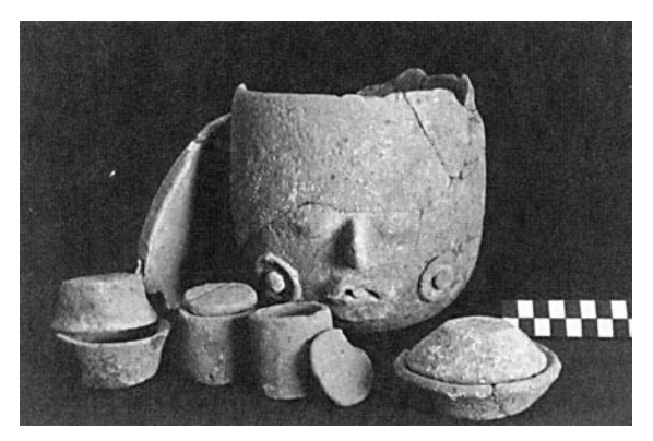
Fig. 2 Typical Caracol cache vessels of the Late Classic era. The lip-to-lip bowls are referred to as "finger bowls" because of their usual contents. The larger urn-like "face cache" with adjacent lid is found throughout the Caracol settlement area.