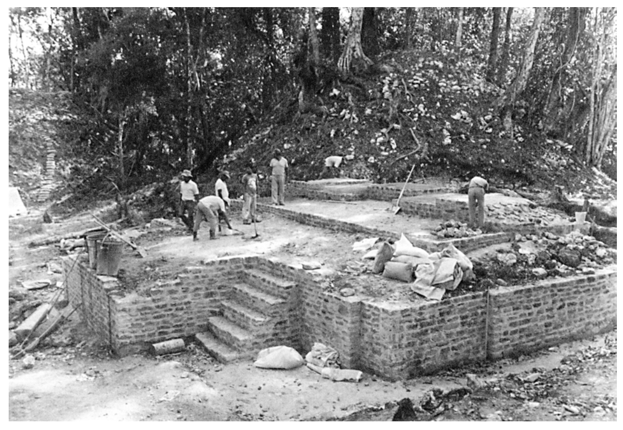
Fig. 1 Caracol Structure A38 during stabilization. One of two eastern buildings in the Central Acropolis, this building contained a tomb within its stairbalk and supported a perishable structure with internal masonry benches.

from the Caracol archaeological data. First, these data do not support the presence of two distinct levels of Maya society, but rather indicate the presence of a large middle level. And, second, these data support the suggestion of cohesion at all societal levels in basic ritual patterns.