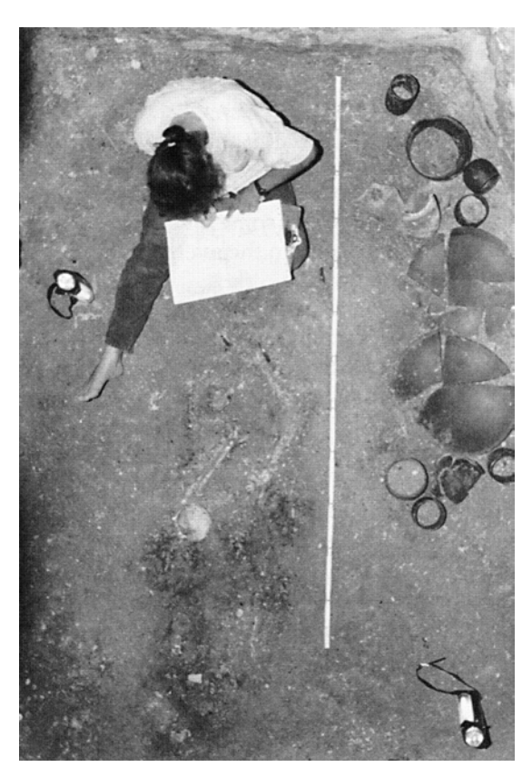
Fig. 6 Telescoped view of the southern part of the Structure B20-3rd tomb floor showing the badly decayed remnants of its single occupant and part of the funerary assemblage. A painted wall text dates this tomb to A.D. 537. Extended stick tape is two meters in length.

The painted tomb texts occur in two forms. The first form is as a text on a red-painted capstone (A. Chase and D. Chase 1987a:15,43). These texts function to dedicate the covering of the tomb itself, whether or not a body was present. Since 60% of Caracol tombs had entranceways for re-entry, it is clear that the chamber itself was considered to be of importance—an inference that gains support in capstone texts that refer to the closing or dedication of the chamber and not the buried individual (cf. Structure A34 lower tomb). The second kind of text found in Caracol tombs is a rear-wall text (A. Chase and D. Chase 1987a:20-30). These texts (in Structures A34, B19, and B20[3]) generally contain a full Long Count date which is believed to refer to the death date of the individual interred in the chamber (cf. those at