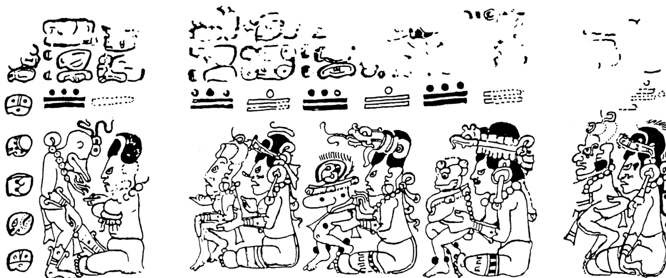
Figure 6. Dresden Codex, folios 19a (detail), 20a, and 21a (detail). Based on the naming patterns observed for Goddess I, the name glyphs above the first and last images of Goddess I can be reconstructed as T171.1026 (from Villacorta and Villacorta 1933).