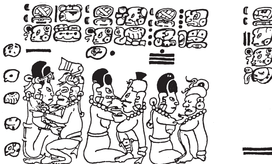
Figure 7. Dresden Codex, folios 21c and 22c (detail). The column of hieroglyphs at the far right of the image shows a name glyph for Goddess I but no corresponding image. The third image of the goddess does not have the T0126 portrait glyph in the corresponding text above her image. The name of the second goddess probably serves for this third goddess (from Villacorta and Villacorta 1933).

is to be read as Ixik Kab "Lady Earth." Alternatively, the reading Kab Ixik would make better sense of the order of the glyphs, in which case the name would mean "Earth Lady." By contrast, the T58 prefix in place of T171 leads to a reading of Sak Ixik "White Lady" (Bassie-Sweet 2008:202). Although there are two different prefixes to the T1026 glyph, and occasions when it is postfixed by