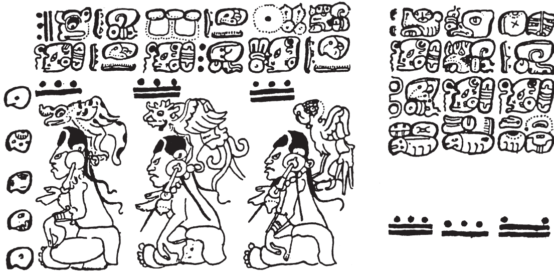
Figure 4. Dresden Codex, folios 16c and 17c (detail). The three name glyphs for Goddess I at the right of the almanac each have the T171 prefix and T102 postfix. None have a corresponding visual representation of the goddess (from Villacorta and Villacorta 1993).