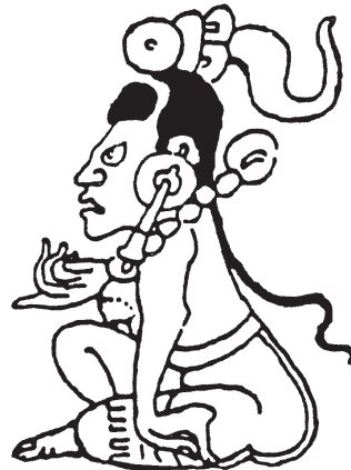
Figure 2. The Youthful aspect of Goddess I (from Villacorta and Villacorta 1993).

Nonetheless, the “white” association is not limited to Goddess I. The T58 prefix is used throughout the Dresden to name other deities, including Goddess