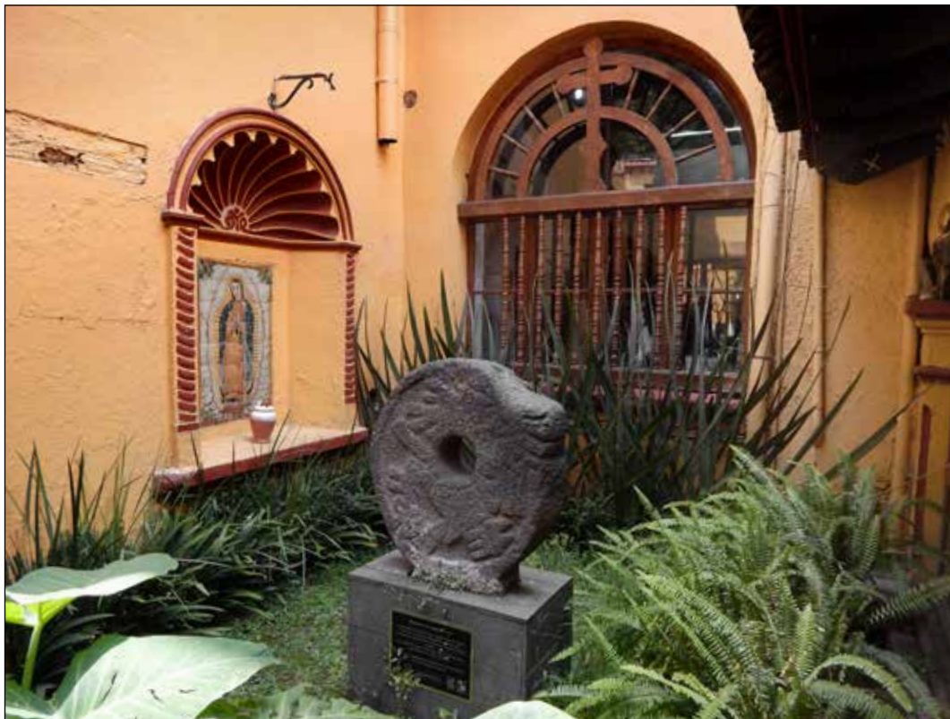
Figure 5. Ballcourt marker within the Casa de Cultura “Jesús Reyes Heróles.”