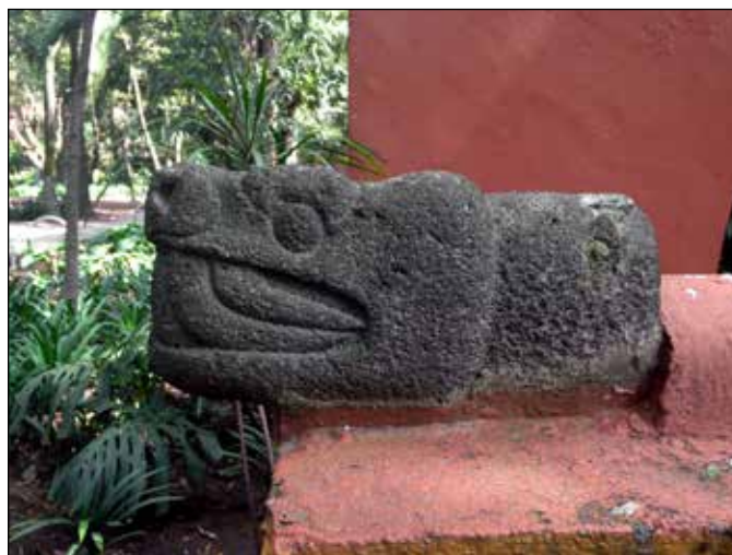
Figure 3. Two views of a sculpture in the form of a serpent head found in the Casa de Alvarado.