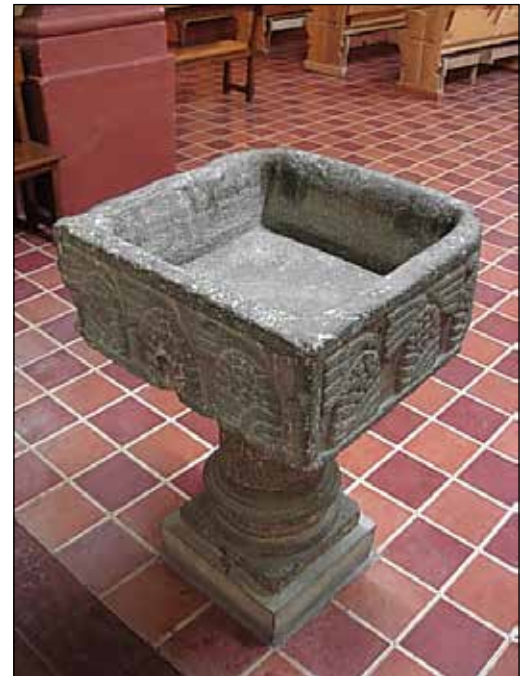
Figure 1. Tepetlacalli or stone coffer decorated with maize cobs, used today as a baptismal font in the chapel of the Cuadrante San Francisco, in the Coyoacan district.

A visit to the churches and colonial mansions of Mexico's capital often brings pleasant surprises, not only to aficionados of the colonial art of New Spain but also those interested in the plastic arts of the societies before the European conquest. For instance, an ancient tepetlacalli or stone coffer of the Late Postclassic (AD 1250–1521), located in the interior of the Chapel of the Cuadrante de San Francisco in Coyacan, was brought to our attention by Alberto Peralta de Legarreta (Peralta de Legarreta 2011; see also López Luján and López Austin 2010, 2011). A quadrangular prism of basalt measuring 62 cm on its sides and 25 cm in height, its side walls are covered by twelve maize cobs carved in bas-relief (Figure 1). Today this tepetlacalli serves as a baptismal font, a function for which it was adapted by enlarging the upper cavity and fashioning a circular drainage hole in one of the sides. In this article, we will consider two other cases in old buildings of the Santa Catarina neighborhood of Coyoacan.