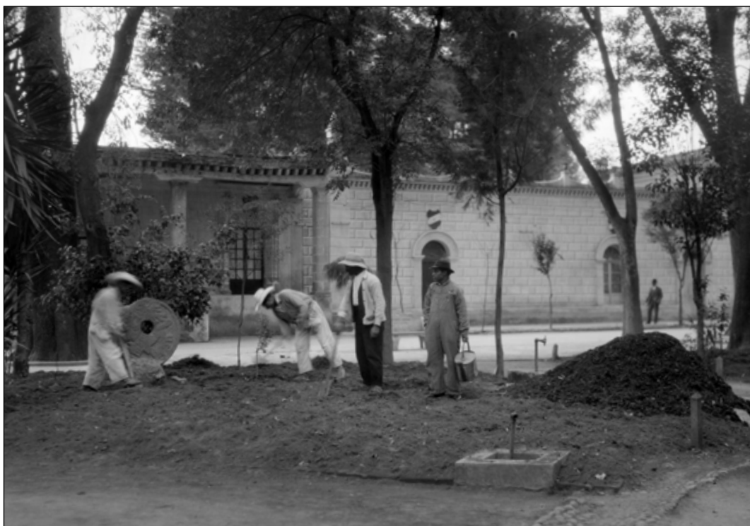
Figure 6. The tlachtamalácatl of Coyoacan in the 1930s in the Jardín Hidalgo.