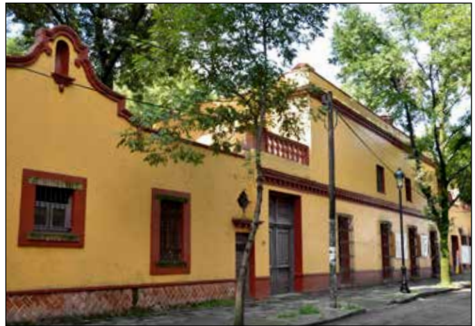
Figure 4. Facade of the mansion occupied by the Casa de Cultura “Jesús Reyes Heróles.”

... on the eastern edge of Plaza Hidalgo and under Calle Allende, two more buildings have been registered. One is