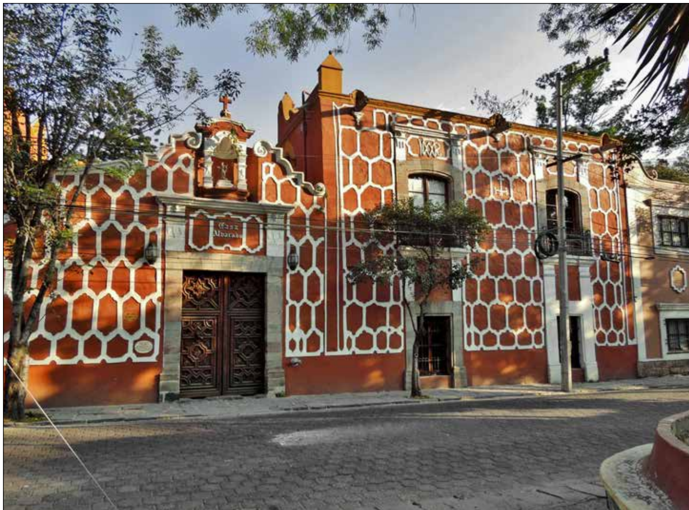
Figure 2. Facade of the Casa de Alvarado, occupied today by the Fonoteca Nacional.