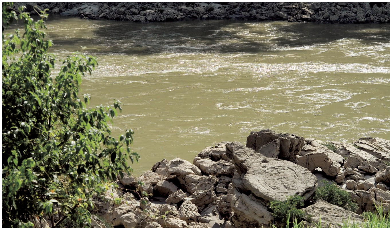
Figure 4. La Roca de los Sacrificios, on the waterfront at Piedras Negras.

by paddling. The left (Mexican) shore generally has better footing for lining and fewer remolinos .