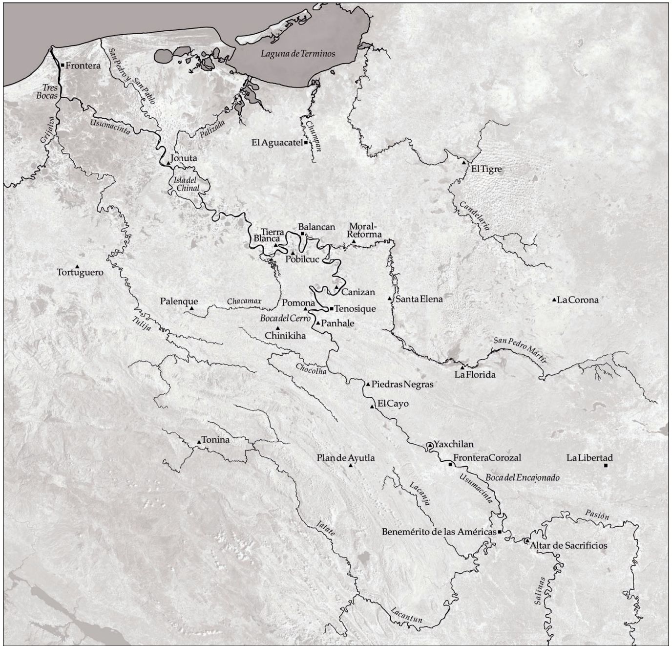
Figure 1. The Usumacinta and other waterways discussed in the text. (Precolumbia Mesoweb Maps.)

A useful approach to understanding navigation on the swift, gorge-bound Usumacinta is to find a well-documented analog. The Missouri Breaks in the USA are in many ways like the Usumacinta between Boca del Encajonado and the mouth of the Chocholha. Both high volume rivers have distinct wet and dry cycles, with corresponding rise and fall. Both are confined for more than 100 km in gorges averaging 200 m deep. Most important, both run at 3 or more kilometers per hour, so that travel is much harder upstream than down. Unlike the Usumacinta, the Missouri Breaks hold no major rapids.