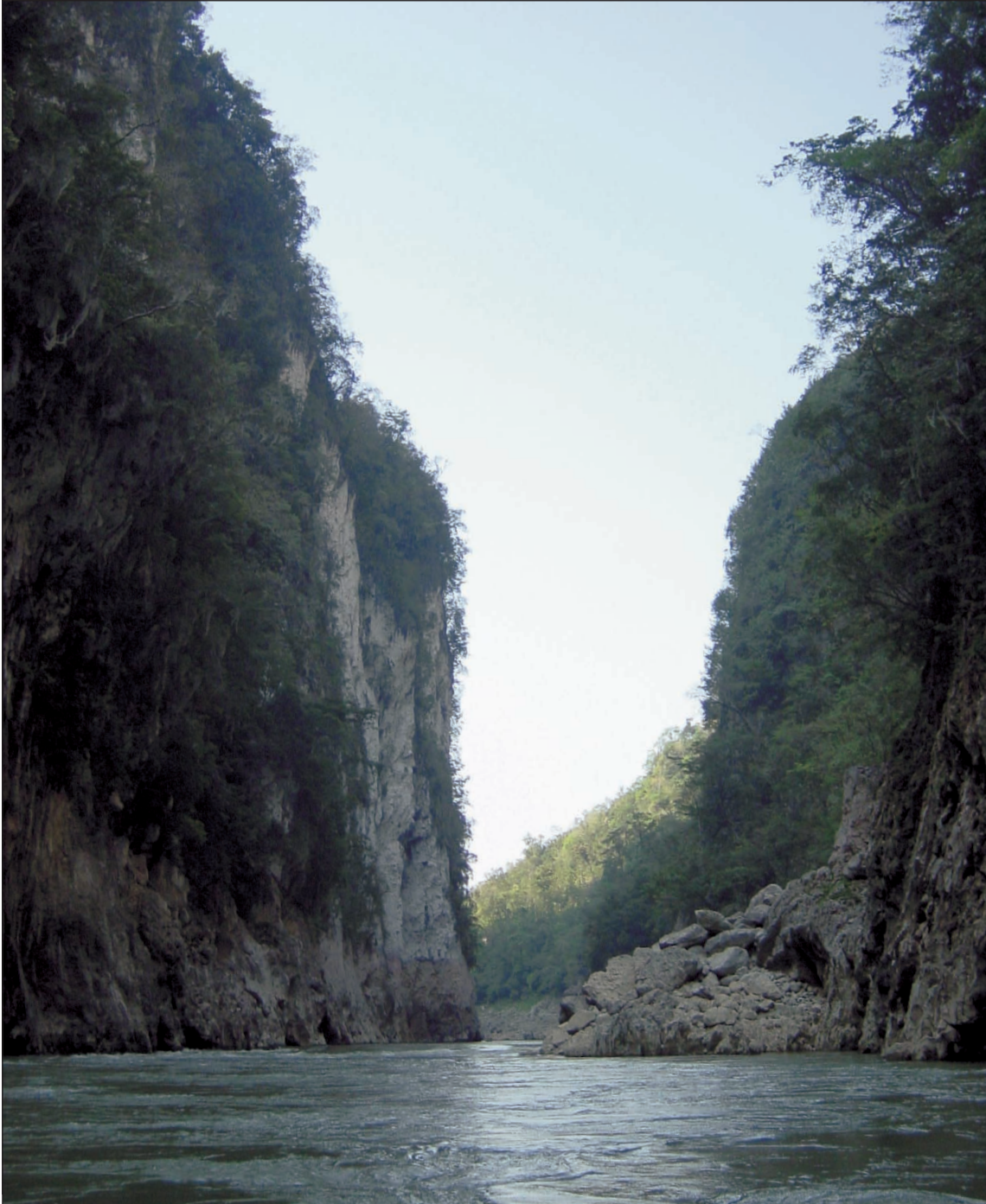
Figure 6. San José Canyon.