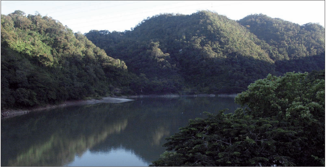
Figure 7. Panhale is located on top of the hill in the middle of this photograph of the Boca del Cerro.