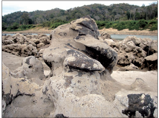
Figure 2. Mooring stone at Yaxchilan.

In 2004 the Usumacinta Navigation Survey identified and mapped mooring stones along the shore. The Maya tied up their dugouts to the same natural bollards over a long time period, leaving the stones deeply grooved by rope wear (Figure 2). The grooves turned out to be excellent indicators of past use, or lack thereof. The waterfronts at Yaxchilan and El Porvenir had large concentrations of