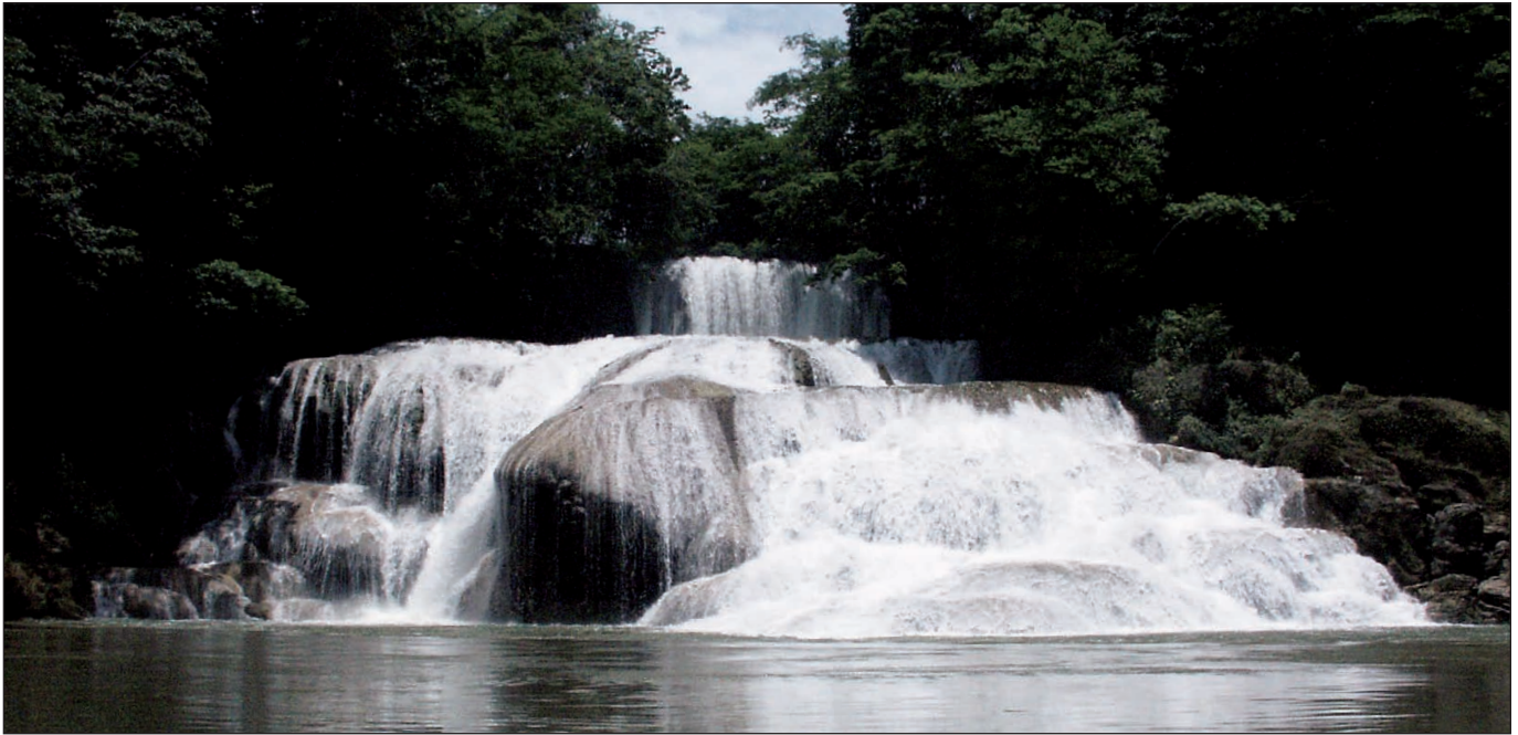
Figure 5. Busilja Falls.

cle rises above the left shore. The third rapid below Cola is Class 2 Raudal de Colalito, a large drop with 0.5 m waves. It ends 3 km above the Busilja. Next is a Class 1-2 with large roaming remolinos . One last Class 1 rapid ends within sight of Busilja Falls.