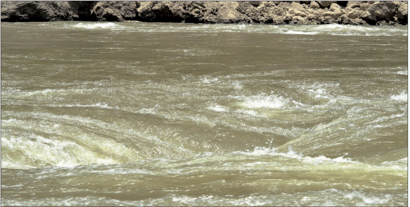
Figure 3. A remolino on the Usumacinta.

long, 0.6 km from top to tail. They are formed by a constriction of the river in a bedrock narrows. Depth is unknown but probably well over 15 m. The steep right (Guatemalan) shore is strewn with large blocks, which make walking a chore and portaging even a light boat challenging.