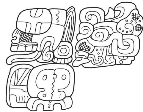
Figure 6.3. Tikal Stela 31 (G5-G6). Drawing: Stephen Houston.

some Nahuatl-speaking, others extending into the highlands of Guatemala (Chinchilla Mazariegos 2013; Díaz Balsera 2008; Jansen 1997). In these areas, the birth of new dynasties fused with images of nascent suns, times of darkness now lit by lambent fire. Some such suns levitated from bloody temples. On page 23 of the Codex Vienna, for example, solar disks rise with bloody trails from a red-streaked smoking building (Figure 6.4; Anders et al. 1992:148; Boone 2000:90, 94; Furst 1978:216, 219-220). One disk even holds the day sign 1 Flower, the same name,