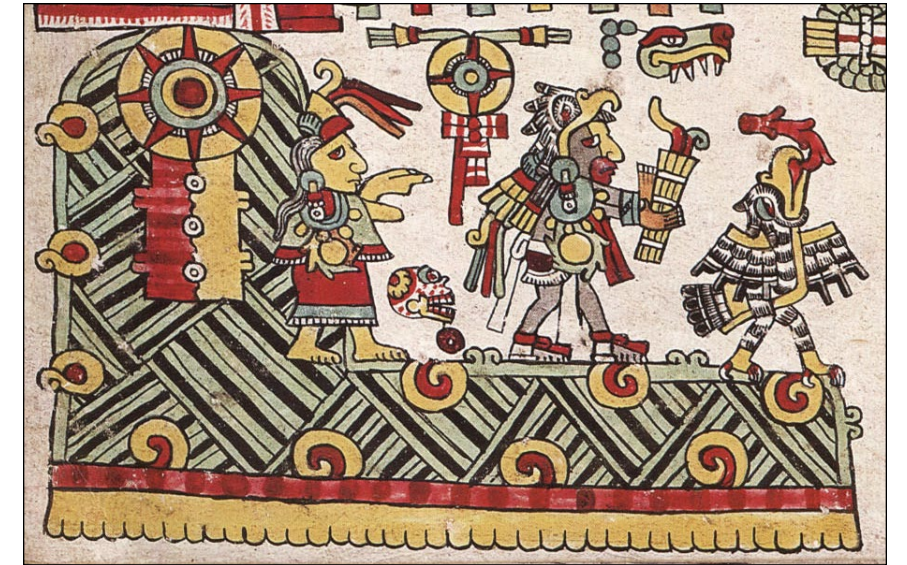
Figure 6.5. Emergent solar disks from the Codex Nuttall, p. 21; British Museum. Photo: Trustees for the British Museum, ET Am1902, 0308.1, Add. Mss. 39671.

On page 21 of the Codex Nuttall, another Mixtec source, the appearance of new dynasties correlates,