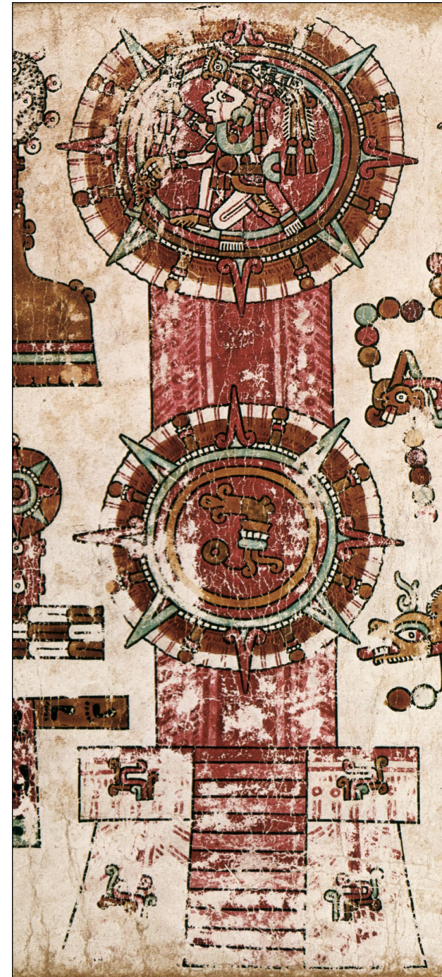
Figure 6.4. Solar disks from the Codex Vienna, p. 23; Österreichische Nationalbibliothek, Vienna.

some Nahuatl-speaking, others extending into the highlands of Guatemala (Chinchilla Mazariegos 2013; Díaz Balsera 2008; Jansen 1997). In these areas, the birth of new dynasties fused with images of nascent suns, times of darkness now lit by lambent fire. Some such suns levitated from bloody temples. On page 23 of the Codex Vienna, for example, solar disks rise with bloody trails from a red-streaked smoking building (Figure 6.4; Anders et al. 1992:148; Boone 2000:90, 94; Furst 1978:216, 219-220). One disk even holds the day sign 1 Flower, the same name,