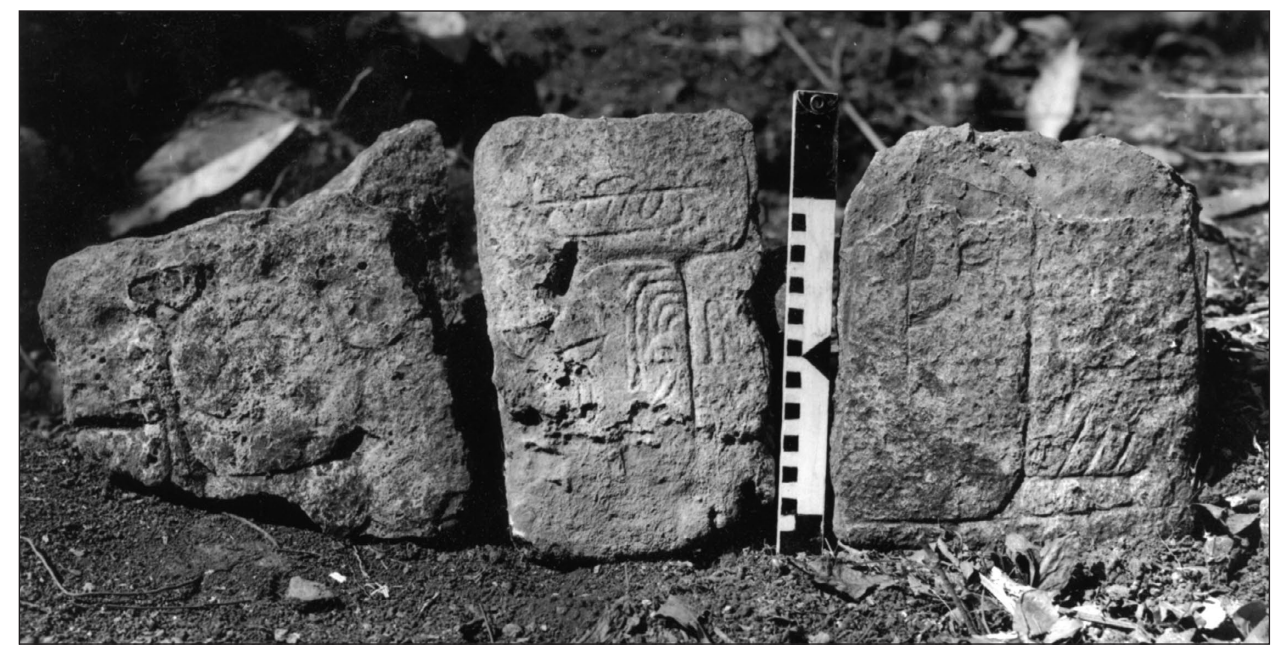
Figure 3. Blocks from La Corona Hieroglyphic Stairway 1 in 1997.

more badly eroded blocks have been recovered since (Figure 3).