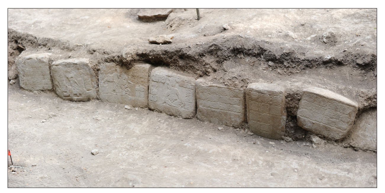
Figure 6. The in situ portion of Hieroglyphic Stairway 2, soon after its discovery in 2012

The discovery in 2012 of twenty-two inscribed blocks on or near the stairway of Structure 13R-10 (Ponce 2014; Ponce and Cajas 2013) now forces us to reevaluate these earlier systems (Figures 6 and 7). This monument — an archaeologically documented stairway consisting of inscribed blocks — by all rights deserved the designation "Hieroglyphic Stairway 2." Moreover, it immediately was apparent that the ancient