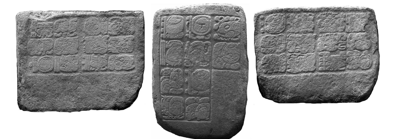
Figure 8. Blocks 9, 10, and 11 of La Corona, Hieroglyphic Stairway 2 (Elements 37, 38, and 39).

public and private collections, (2) the many stones that the ancient Maya themselves removed from other locales and placed in secondary context, principally in and around Structure 13R-10.