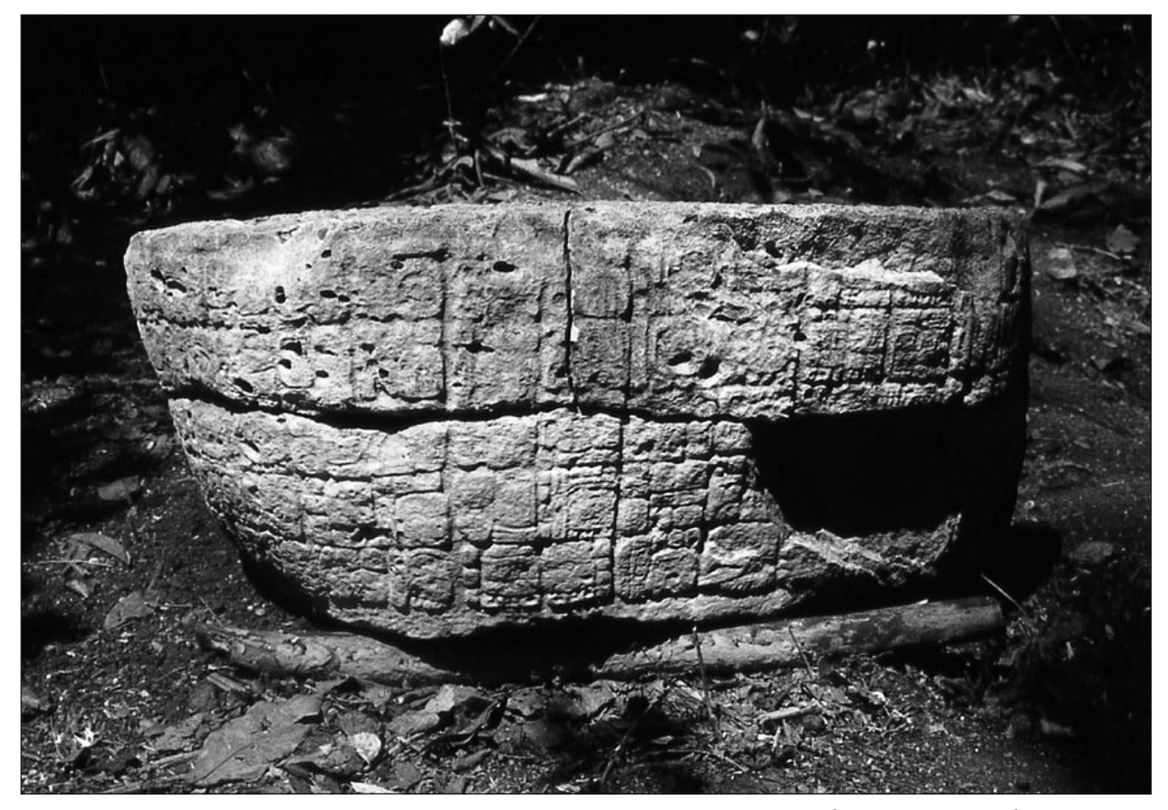
Figure 2. La Corona Altar 2 as reconstructed in 1997. A fragment corresponding to the gap at lower right was found in 2011.

When the ruins of La Corona were first systematically explored in 1997 by Graham and Stuart, several stelae and altars were found and given numbers (Graham 1997, 2010; Stuart 2001). These were Stelae 1 and 2 and Altars 1 through 4, all of which were discovered in situ, mostly concentrated in the main plaza. Altar 4, one of the latest sculptures of La Corona, was first found in many scattered fragments but reconstructed during that initial visit (Figure 2; an additional piece of Altar 4 was discovered by Bruce Love in 2011). Also discovered at that time were a number of small inscribed slabs near the south side of the plaza, which clearly were the facing stones of a stairway. These were given the collective designation of Hieroglyphic Stairway 1, and many