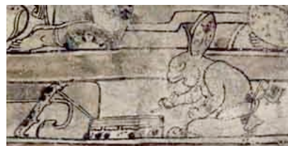
Kerr No. 0511: Rollout and Detail of Right-Handed Supernatural “Rabbit” Scribe