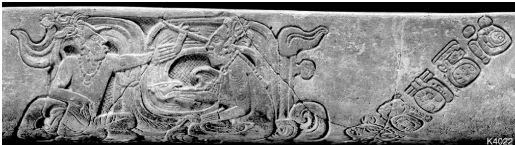
Kerr No. 4022: Rollout Photograph

There is one particularly important example of a left-handed supernatural painter. This painter can be found in the iconographic narrative on Kerr No. 4022: