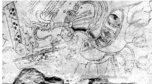
Kerr No. 1185 and 1565: Detail of a Right-Handed Scribe