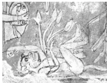
Kerr No. 5637: Detail of Howler Monkey and Sprouting Paper Bark Tree

The howler monkey tail was envisioned as a blossoming vine or branch, which itself became represented as a serpent. The fact that these vines or branches and serpents indeed refer to the same symbolic object can be established through the fact that they all emerge from the opened mouth of a raptorial bird, in all probability a Great Horned Owl (cf. Boot 2003). The close association between the howler monkey as patron of writing and painting and the blossoming vines or branches of the Ficus cotinifolia (or a related native fig tree) or bark paper tree can be found illustrated on Kerr No. 5637: