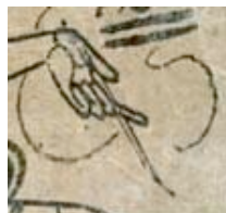
Kerr No. 1196: Rollout Photograph and Detail of Hand