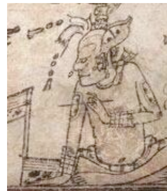
Kerr No. 8425: Part of Rollout Photograph and Detail of Scribe