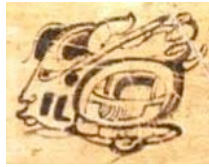
Left hand holding brush or quill pen