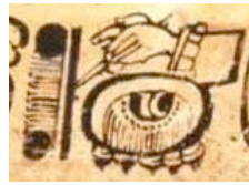
Right hand holding brush or quill pen

The first glyphic collocation provides the title of a lady ( ixik ). The hieroglyphic sign superfixed to the T561(var) SKY sign is clearly an open hand holding a brush or quill pen. The specific position of the hand, with the thumb pointing upwards and the brush or quill pen resting on the open palm of the hand, indicates that here the left hand has been depicted.