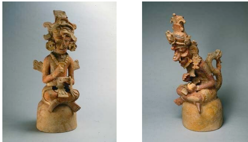
Two Ceramic Statuettes (Cleveland Museum of Art Inv. No. 1994.12.1 & 1994.12.2)

Already in the Early Classic there seems to have been a preference for the right hand in the context of Maya writing-painting. A pair of Early Classic ceramic statuettes (probably the top part of cache vessels) shows this preference for the right hand: