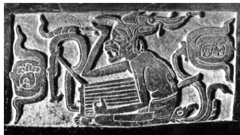
Kerr No. 0954: Detail of the Howler Monkey Scribe