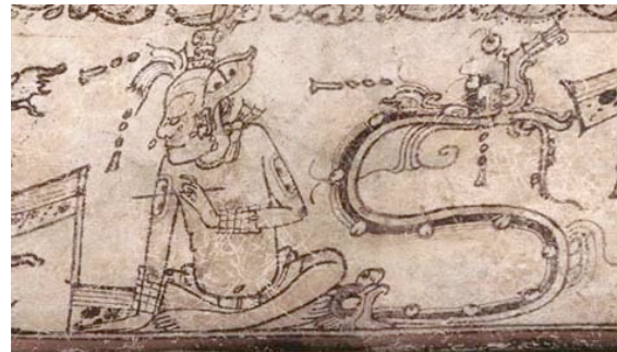
Details of Scribes from Kerr No. 1523 and 8425

These two examples illustrate a supernatural scribe to whose back is attached the head of a raptorial bird. From the bird's mouth emerges a serpent with opened jaws that serves as a tail