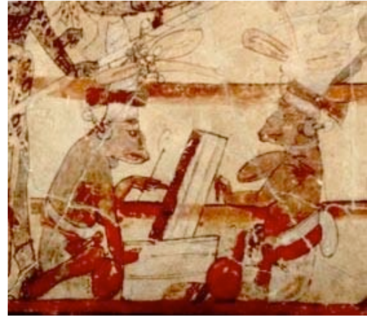
Kerr No. 3413: Rollout Photograph and Detail of the Monkey Scribes

The complex iconographic narrative of Kerr No. 3413 contains the image of two supernatural howler monkey scribes on either side of an opened screenfold book. The monkey scribes have been identified as the supernatural patrons of writing, painting, and the arts in general (cf. Coe 1977). The howler monkey scribe on the left has his left hand raised, and it is in this hand that he holds a brush or quill pen. Although not actually writing or painting, the howler monkey scribe holds, i.e. manipulates, the writing or painting implement with his left hand and as such indicates hand preference. The howler monkey scribe on the right has his right arm crossed over his chest, while his left arm is raised and its hand touches the back of the screenfold book. At least one of the two howler monkey scribes is clearly left-handed.