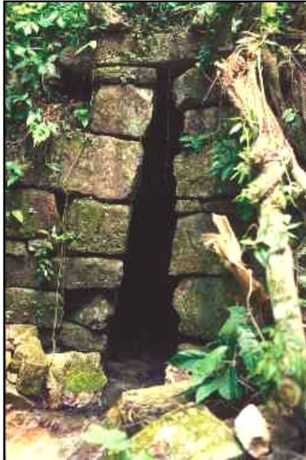
Figure 10 - The exit of the Picota aqueduct

Two major spring sources flow a short distance and join at the beautiful entrance of the Picota aqueduct (see Figure 9) to create the Picota stream. The stream then flows beneath a structure and continues underground for 50 meters forming a land bridge over the Picota. This land bridge is very similar in size and function to that of the Otulum. The stream then exits through a massively constructed archway (see Figure 10). After exiting the aqueduct the Picota continues north then east and northeast, forming the boundaries of Picota