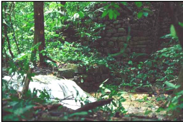
Figure 3 - Motiepa's partial dam

The Motiepa is the next major stream to the west of the Otulum. The Motiepa's source is unknown because it begins outside of the site boundary. Much like the Otulum, the Motiepa begins at a high elevation in the mountains. This water source defines the western boundaries of the