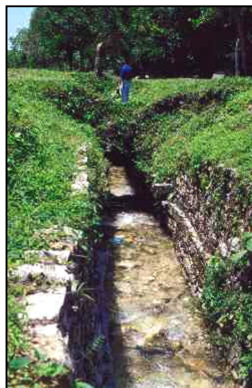
Figure 1 - The Otulum

Another aspect of the Palenque Mapping Project is the documentation of the numerous water features found within the site boundary. Palenque's water management differed from that of other lowland Maya sites due to its many perennial water sources. The Palenque Mapping Project has located twenty-six springs within site boundaries. Of those, thirteen are associated with architecture. Most of the sites in the lowlands dealt with the conservation and storage of water. Palenque had an abundance of water, which gave them an opportunity to devise new and inventive ways of controlling and moving the flow of water. This helps to explain the extreme diversity of Palenque's water management systems.