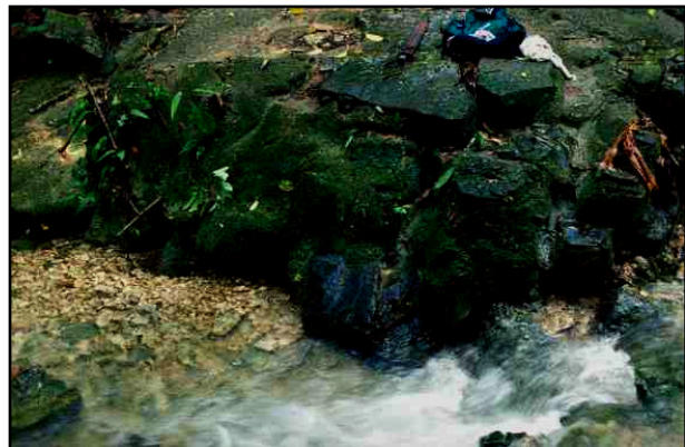
Figure 4 - Motiepa's calcified aqueduct

Encantado Group and Group E, and the eastern boundaries of the Xinal Pa' and Moises Retreat. The most interesting water features on the Motiepa are a partial dam (see Figure 3) and a heavily calcified aqueduct (see Figure 4). This aqueduct is difficult to completely