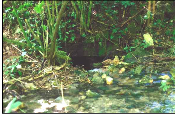
Figure 9 - The entrance to the Picota aqueduct

As the water flows further north, the amount of cut stones within the stream becomes very dense (see Figure 8). The peculiarity of this is that there are few structures in this area that have been destroyed or are missing large amounts of stone. This high density of cut stone is unexplainable without further research.