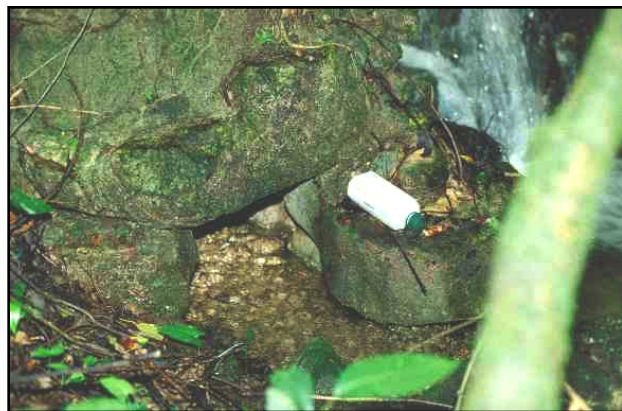
Figure 6 - The exit of Piedras Bolas aqueduct

The first water feature that this stream enters is a fascinating aqueduct located near structure 30 of the Xinil Pa' Group. This particular aqueduct is partially collapsed at its southern end. At this location of the aqueduct the dimensions are approximately 50 cm