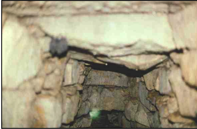
Figure 5 - Interior of Piedras Bolas aqueduct

The Piedras Bolas is similar to the Otulum and the Motiepa, in the sense that it starts at a high elevation in the mountains to the south of the site. Due to the close proximity of the two streams in the south, it is speculated that they share the same source that would