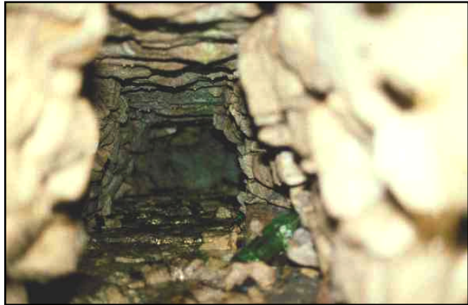
Figure 7- Interior of Piedras Bolas aqueduct

dimensions are approximately 25 cm x 25 cm (see Figure 6). Although water still flows through the aqueduct, it does so slowly due to the collapse. Because of this, the majority of the water now has been forced to flow to the west side of the aqueduct. Prior to the collapse, the majority, if not all, of the Piedras Bolas would have flowed through this system. Taking a large amount of flowing water and decreasing the size of its path creates pressure, thus the aqueduct would have created a large amount of water pressure.