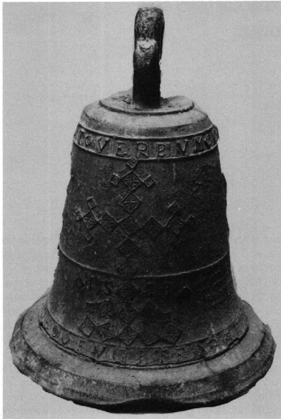
Fig. 1 Palenque Bell.